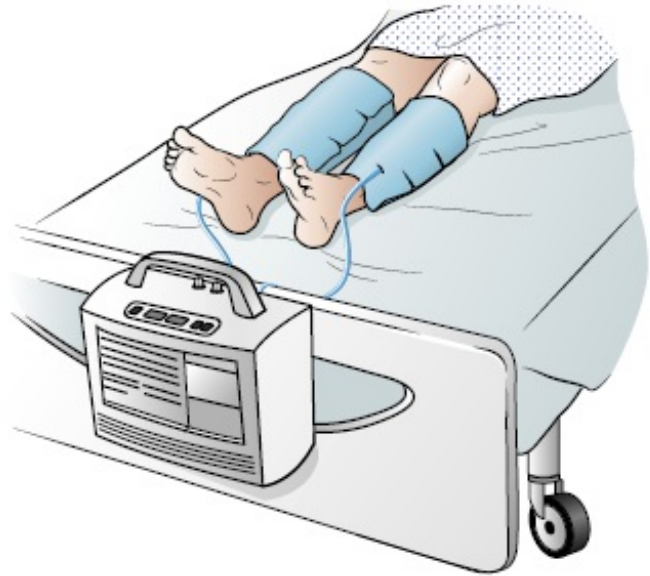
Figure 3. SCD sleeves on your legs

SCDs are sleeves that wrap around your lower legs (see Figure 3). The sleeves are connected by tubes to a machine that pushes air in and out of the sleeves to gently squeeze your legs. This is a safe and effective way to help your blood circulate (move around) to prevent clots.