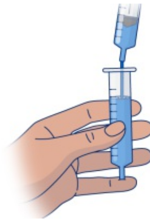
Figure 2. Fill syringe with 10 mL liquid

4. Fill the syringe with 10 mL of your liquid. You can use the other syringe to do this more easily (see Figure 2).