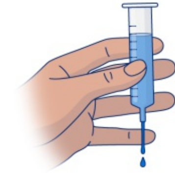
Figure 3. Take finger off syringe tip