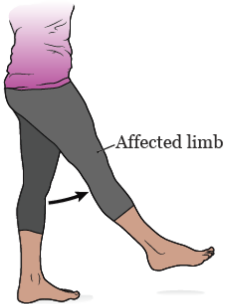
Figure 2. Flexing your hip