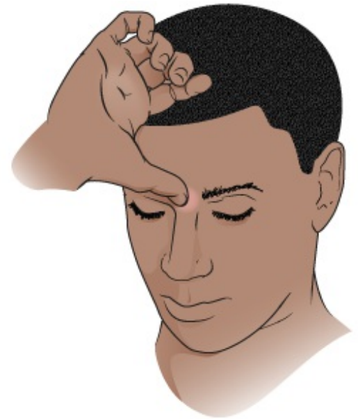
Figure 2. Placing thumb between eyebrows

You can do acupressure on this point a few times a day until your symptoms improve.