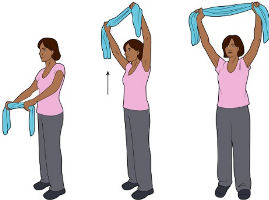
Figure 3. Stretching up