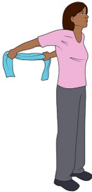
Figure 4. Stretching back