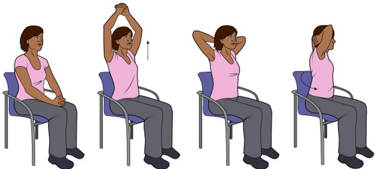
Figure 2. Axillary stretch