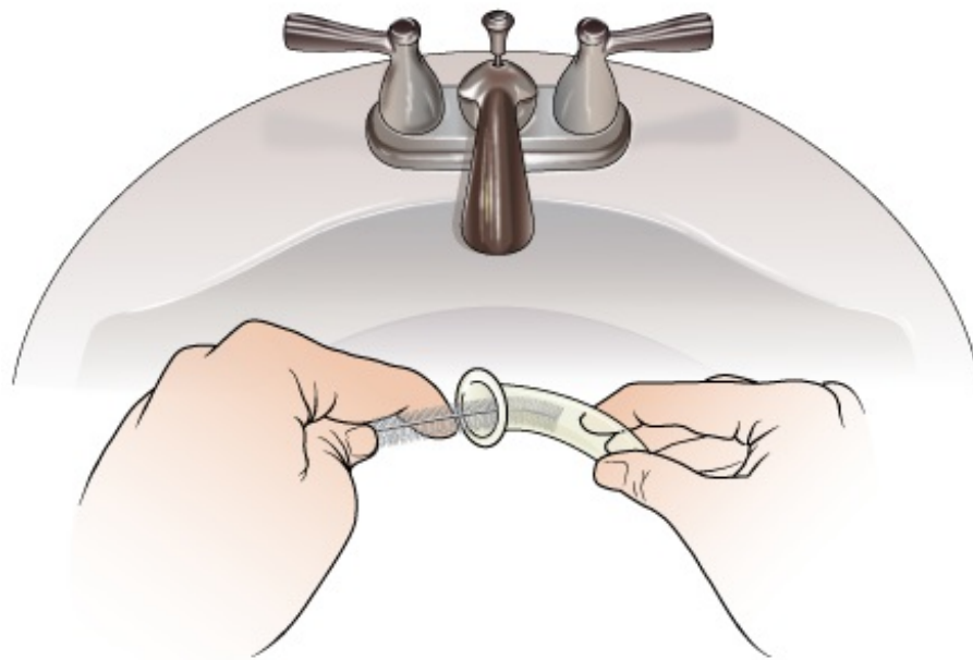
Figure 2. Cleaning your laryngectomy tube