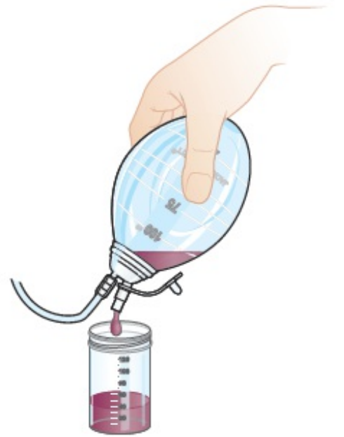
Figure 2. Emptying the bulb