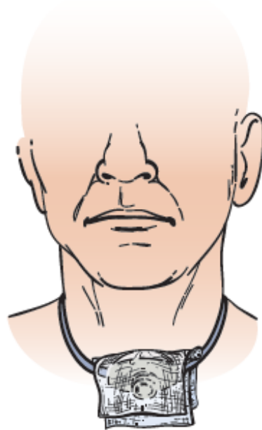
Figure 4. Moistened gauze placed over the tracheostomy tube opening