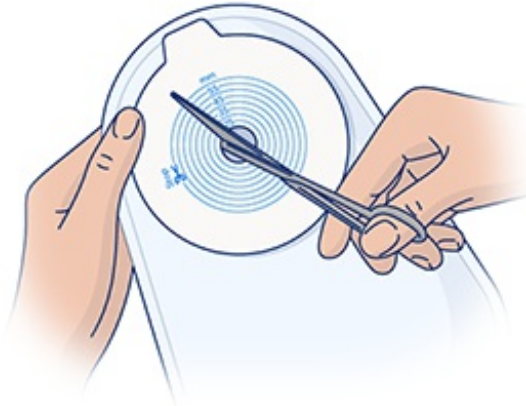
Figure 5. Cutting the wafer for a 1-piece system