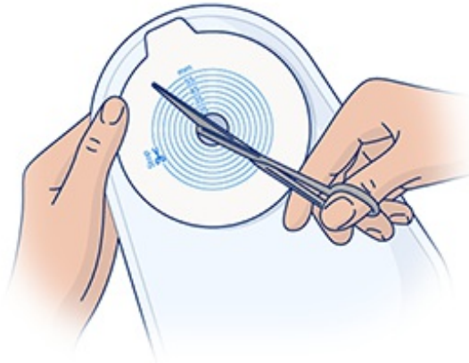
Figure 5. Cutting the wafer for a 1-piece system