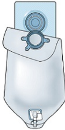
Figure 2. Attaching the pouch to the wafer in a 2-piece system