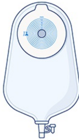
Figure 3. Connected pouch and wafer in a 1-piece system