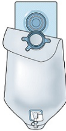
Figure 2. Attaching the pouch to the wafer in a 2-piece system