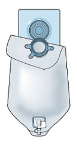
Figure 2. Attaching the pouch to the wafer