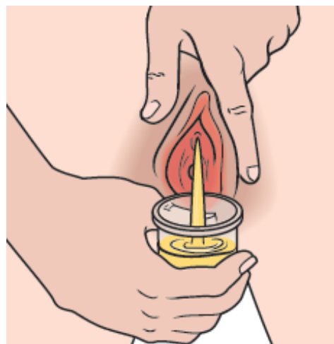
Figure 3. Urinating into the urine cup