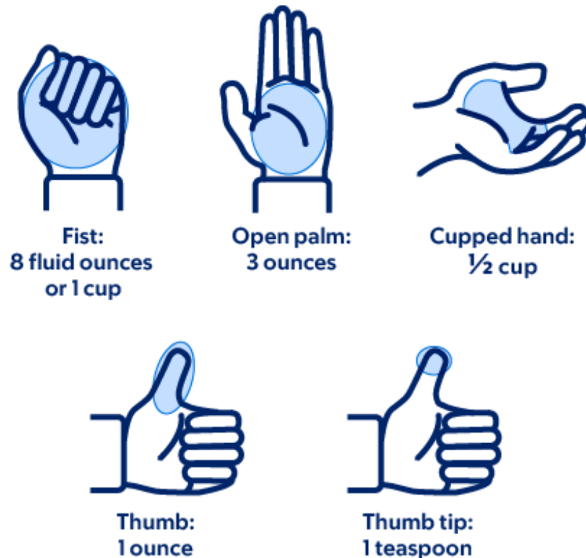
Figure 4. How to measure portion size with your hand

To measure foods, use measuring spoons, measuring cups, or a food scale. You can also use the guidelines in Figure 4 to estimate amounts of some foods.