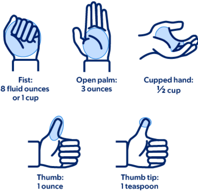
Figure 4. How to measure portion size with your hand