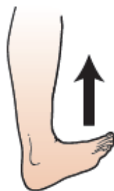
Figure 13. Pointing your toes up