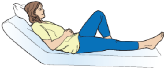
Figure 6. Bending your leg