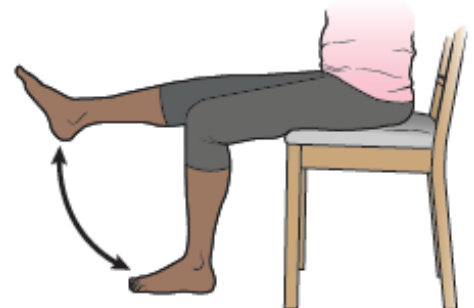
Figure 16. Kicking your foot up