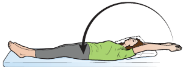
Figure 11. Overhead stretch