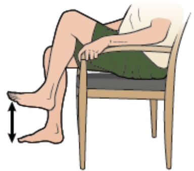
Figure 15. Marching in place