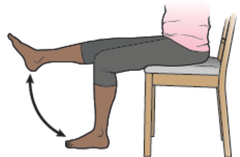
Figure 16. Kicking your foot up