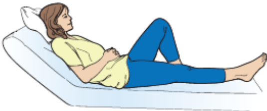
Figure 6. Bending your leg