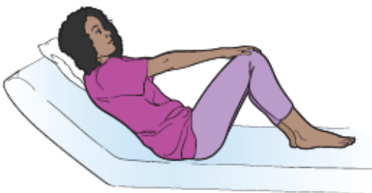
Figure 8. Reaching your arms out