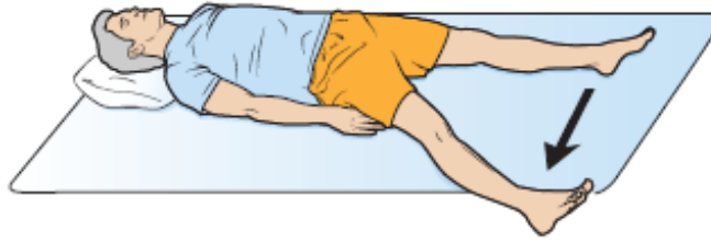
Figure 5. Abductor strengthening