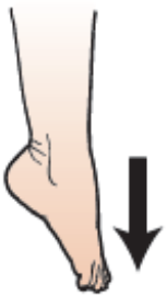
Figure 14. Pointing your toes down