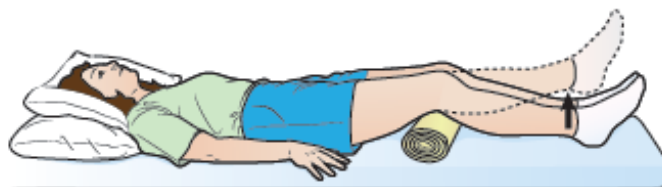
Figure 2. Short arc quads