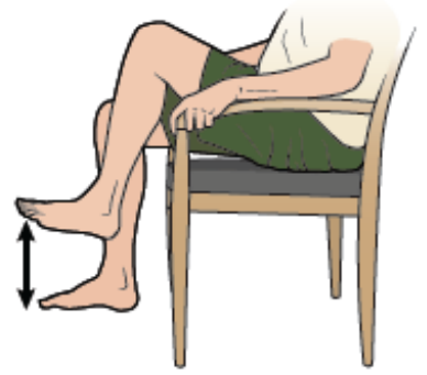
Figure 15. Marching in place