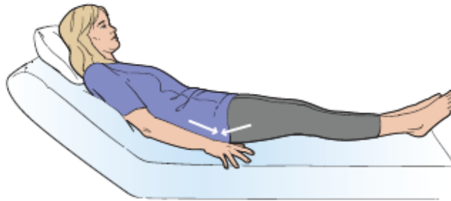
Figure 4. Gluteal sets