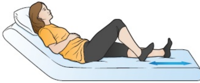
Figure 1. Heel slides