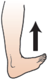
Figure 13. Pointing your toes up