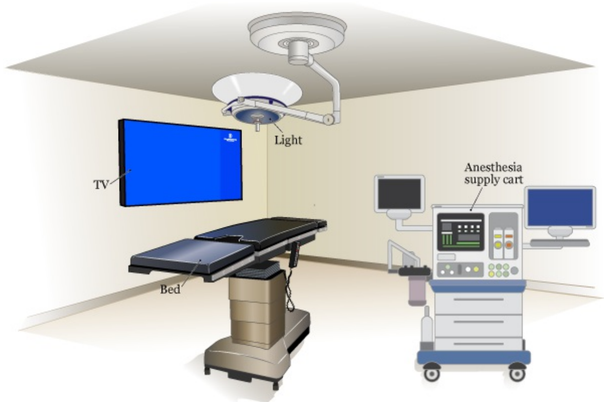
Figure 1. The exam room