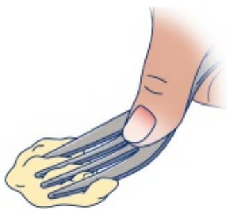
Figure 3. Fork pressure test

Place your fork over your food. Using your thumb, press down on your fork (see Figure 3). Your food is soft enough if it is completely squashed and does not go back to its original shape.