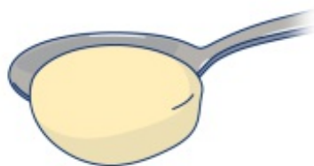
Figure 2. Spoon tilt test

Your food should easily slide off with almost no food left on the spoon (see Figure 2). It's OK if you need to gently flick the spoon to get the food to fall off. Your food is too thick if it sticks to the spoon or does not fall off the tilted spoon.