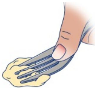
Figure 3. Fork pressure test

Place your fork over your food. Using your thumb, press down on your fork (see Figure 3). Your food is soft enough if it is completely squashed and does not go back to its original shape.