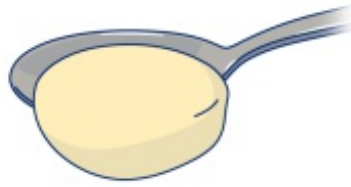
Figure 2. Spoon tilt test