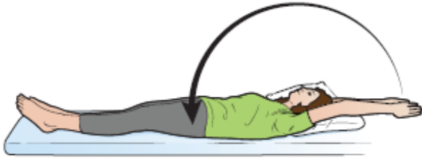
Figure 7. Arms over your head