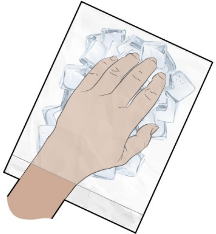
Figure 2. During nail cooling

Your nurse and other members of your healthcare team will wrap your hands, feet, or both in ice packs or ice bags, at least 15 minutes before you start chemotherapy (see Figure 2). The ice will stay on throughout your treatment and will be removed 15 minutes after your chemotherapy ends. The ice may need to be changed during your treatment if it starts to melt. It's important to keep the ice on during the recommended time so that you can fully benefit from the cooling.