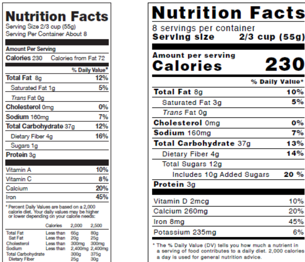
Figure 4. Food labels

Here are some examples of food labels (see Figure 4).