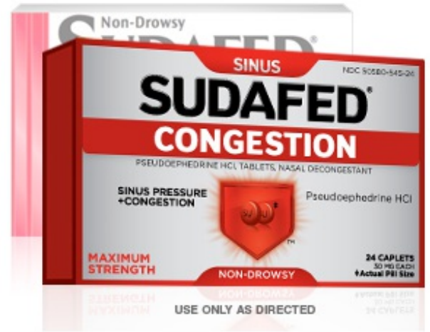
Figure 4. Pseudoephedrine HCl

If you have problems with your heart, talk with your cardiologist about whether it's safe for you to take pseudoephedrine HCl.