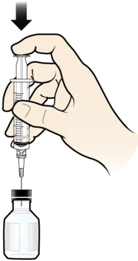
Figure 1. Injecting air into the vial