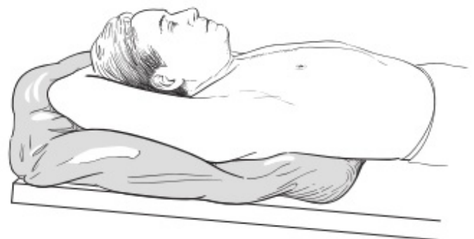
Figure 1. Positioning in the mold

You will probably be lying on your back throughout your simulation. While you are lying on the table, a mold will be made of your upper body. Your radiation therapists will pour a warm