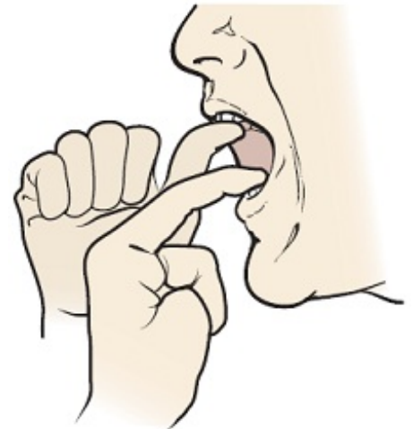
Figure 5. Use your fingers to give extra resistance