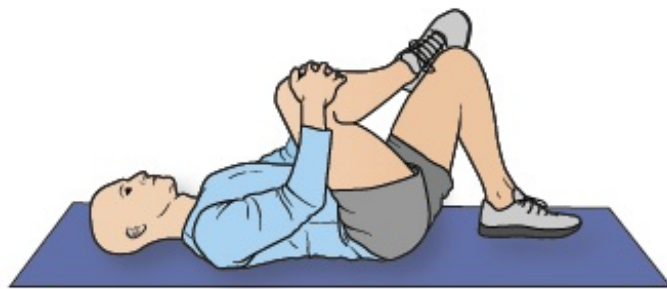
Figure 6. Hip stretch