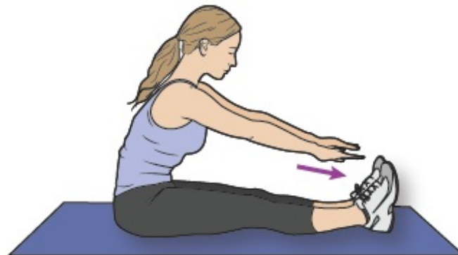
Figure 5. Hamstring stretch