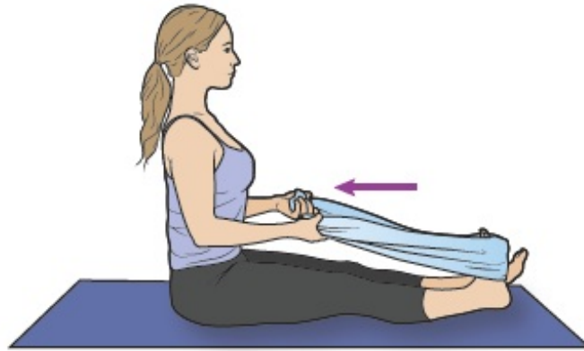
Figure 4. Calf stretch