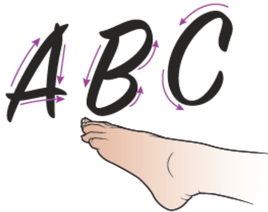
Figure 3. Ankle alphabets

Move your feet to spell the letters of the alphabet (see Figure 3). Go through the alphabet at least 2 times with each foot.