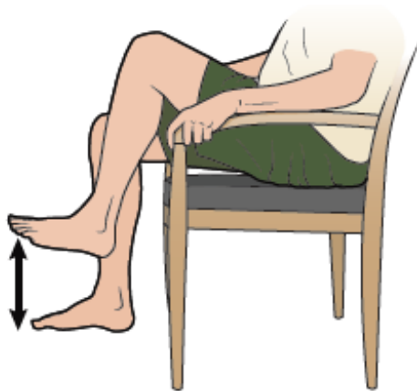
Figure 1. Marching in place