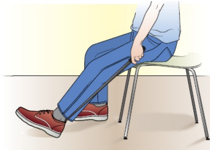
Figure 2. Using a shoe horn

If you have a hard time putting on or taking off shoes because your feet are swollen: