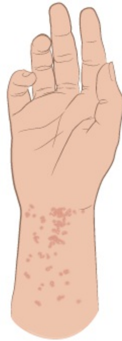
Figure 1. Scabies rash and burrows

The itching and rash can happen anywhere on your body, but they're more likely to happen on or around the following areas (see Figure 2):