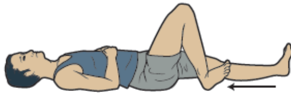
Figure 6. Heel slides