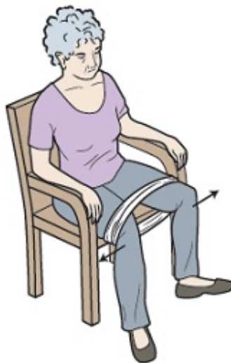
Figure 7. Seated abductor strengthening with elastic band