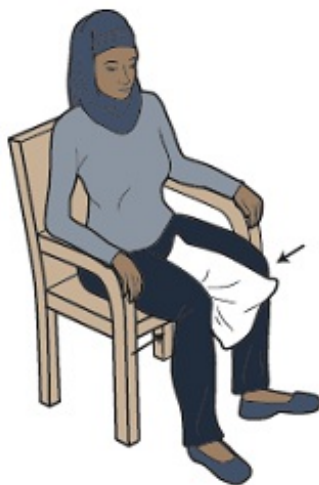
Figure 8. Seated pillow squeezes