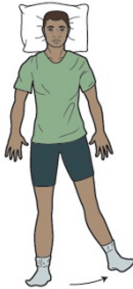
Figure 5. Abductor strengthening exercise