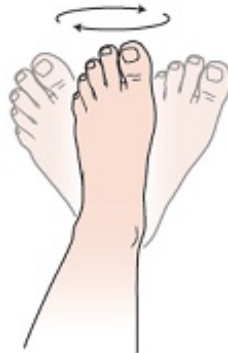
Figure 1. Ankle circles