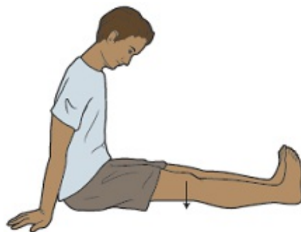
Figure 3. Quadriceps sets