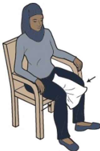
Figure 8. Seated pillow squeezes