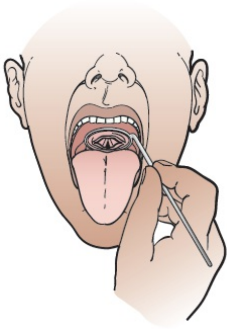
Figure 2. Looking at your vocal cords

Your vocal cords are important for breathing, coughing, making sounds, and swallowing.