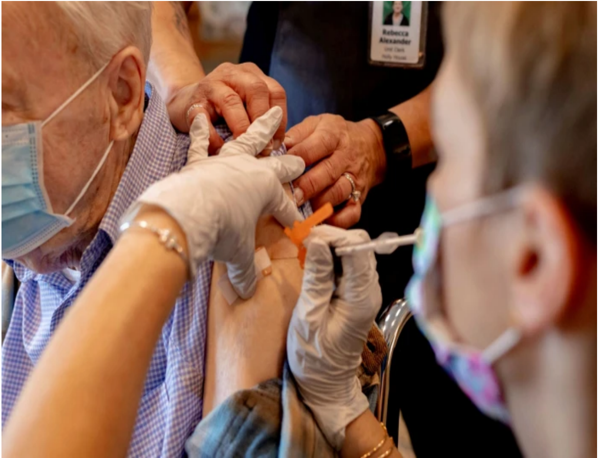
The pioneering BioNTech/Pfizer mRNA vaccine has helped to dramatically reduce deaths from Covid-19

“It was beautiful,” says Balachandran about the restaurant that once served as a hospital, and the conversation: “The purpose and the mission was common between us.”