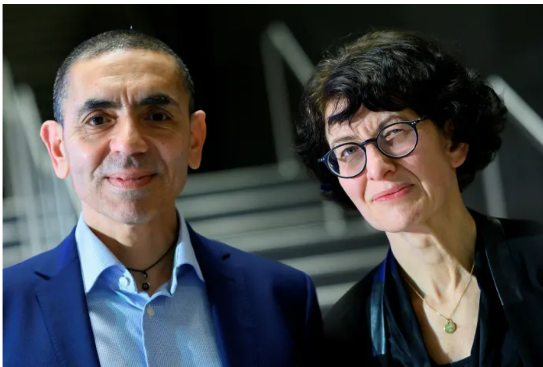
His research caught the eye of Ugur Sahin and Ozlem Tureci, founders of German biotech company BioNTech