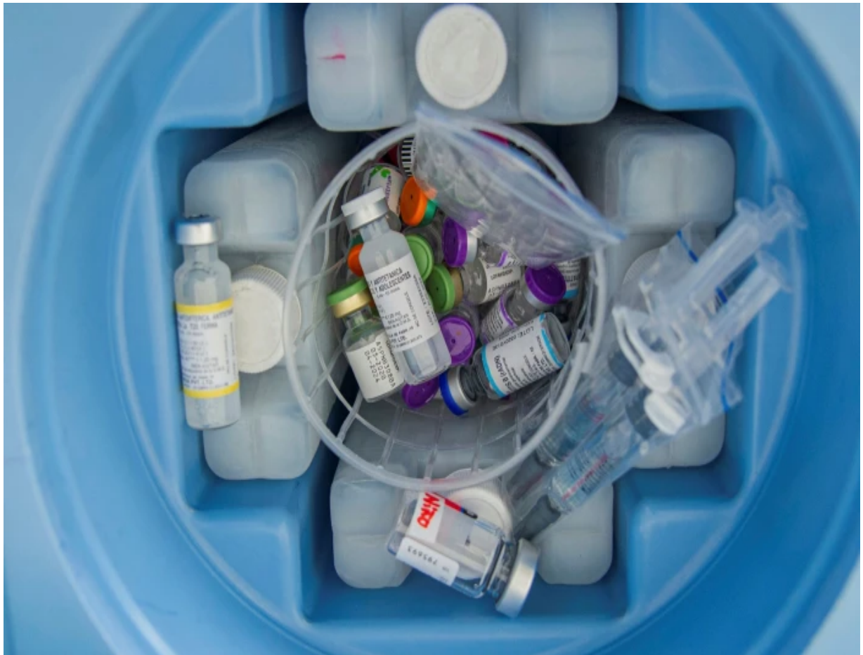
Future mRNA vaccines may be able to treat Covid-19, flu and respiratory syncytial virus in one jab

Pfizer’s flu jab is its only other mRNA collaboration with BioNTech so far. “I think we are capable of going alone for everything but that doesn’t necessarily mean that’s what we’ll choose to do,” says Dormitzer. The company has yet to reveal which other areas it plans to target with mRNA but Dormitzer says rare diseases, protein replacement and gene editing “are all of interest”.